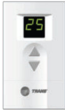
Proportional Thermostat (Option)