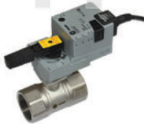
Trane Control Valve (Option)