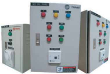
AHU Starter Panel (Option)