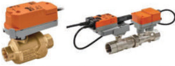
PICV Valve (Option)