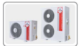
CONDENSING MODEL : CCS-32ES