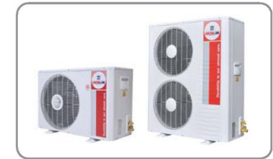
CONDENSING MODEL : CCS-32ES