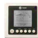
Digital Room Thermostat