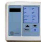
New Digital Wired Display